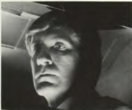
David Warner plays a power-hungry executive whose alter-ego is a feared electronic warrior.

phy for the real world took place at locations around Los Angeles, and at the U.S. Government's futuristic Lawrence Livermore Laboratory outside Oakland, California. "TRON" is the first motion picture to be allowed use of the laboratory, a world center for laser fusion research, as a setting.