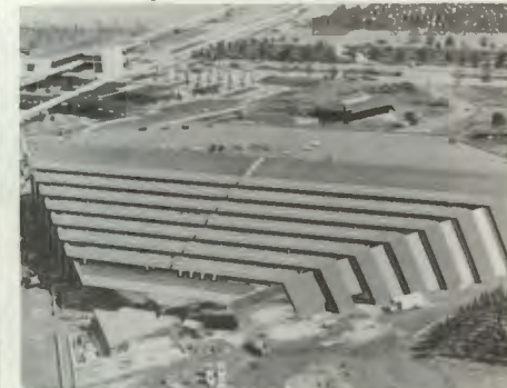
• The Universe of Energy as it stands today. It's located between Spaceship Earth and Horizons in Future World.

will meet all our requirements. Instead of concentrating our efforts on one kind of resource, we must harness many forms of power for a healthy energy diet. And, we must not forget to conserve present-day fuels.