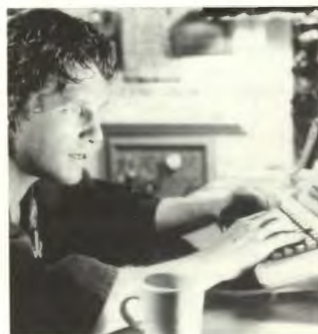
Jeff Bridges stars in "TRON" as Flynn, a video game virtuoso who tries to stop a runaway computer system and lands in an incredible electronic universe... a world in which computer programs live as the alter-egos of their programmers.

The electronic world was shot on sound stages at the Studio in Burbank. Photogra-